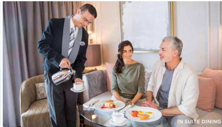
IN SUITE DINING