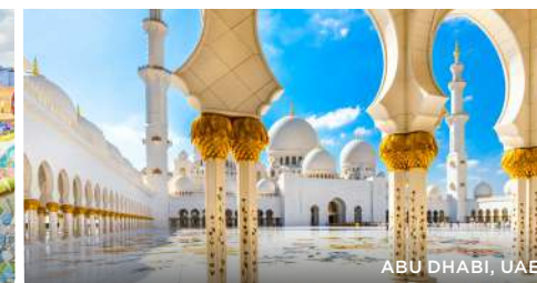
ABU DHABI, UAE