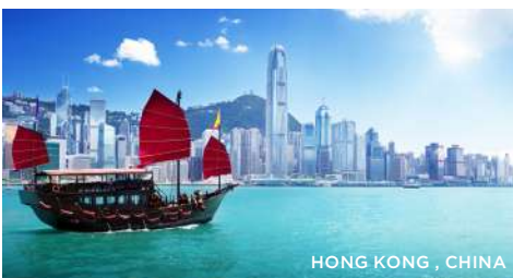
HONG KONG, CHINA

30 30TH ANNIVERSARY COLLECTION | CY - CRYSTAL SERENITY | CS - CRYSTAL SYMPHONY